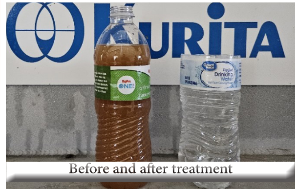
Before and after treatment