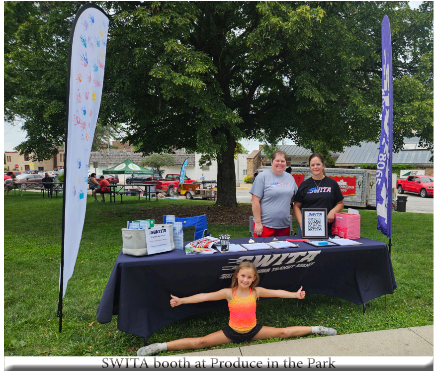
SWITA booth at Produce in the Park

SWITA staff have been helping families get their students signed up via online registration, phone assistance, in the office, and at some events. Staff made an appearance at Produce in the Park in Atlantic on August 7th with information on registration, other service information, and some fun giveaways. Transit staff also made a visit to a back to school event in Atlantic as well to help provide guidance.