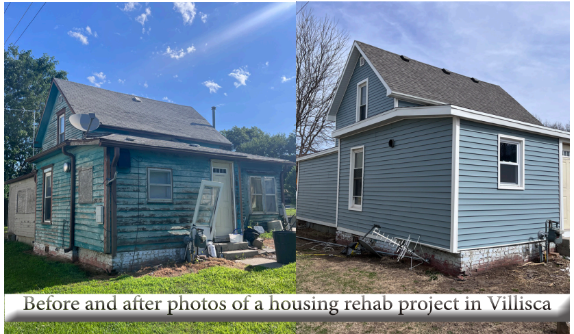
Before and after photos of a housing rehab project in Villisca

often directed to SWIPCO from cities and counties or other resources, and then they are added to a waiting list to determine eligibility and possibly get assistance.