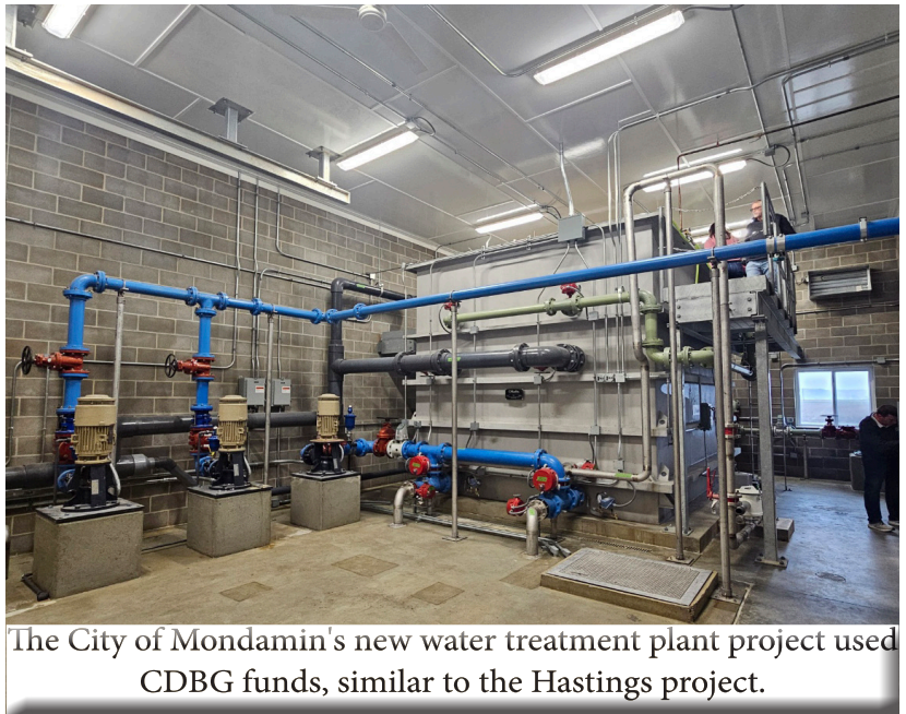
The City of Mondamin's new water treatment plant project used CDBG funds, similar to the Hastings project.

Little Sioux has been awarded $500,000 for a high need project that will update their water mains. Many of the community's water mains are a small diameter and prone to breakage. Also, due to their small size they don't work well, if at all, for fire protection. This issue has caused insurance premiums for residents to skyrocket due to the high fire risk. This grant will help fund updating the water mains to make them the proper size and they will also install a new elevated storage tank, new aerator, and new detention tank. This important project will both improve water quality and fire protection capability, in turn improving insurance costs for residents.