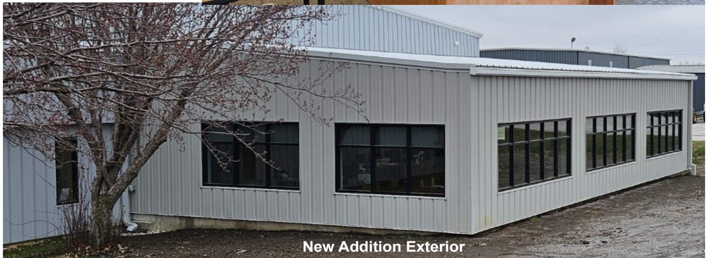
New Addition Exterior