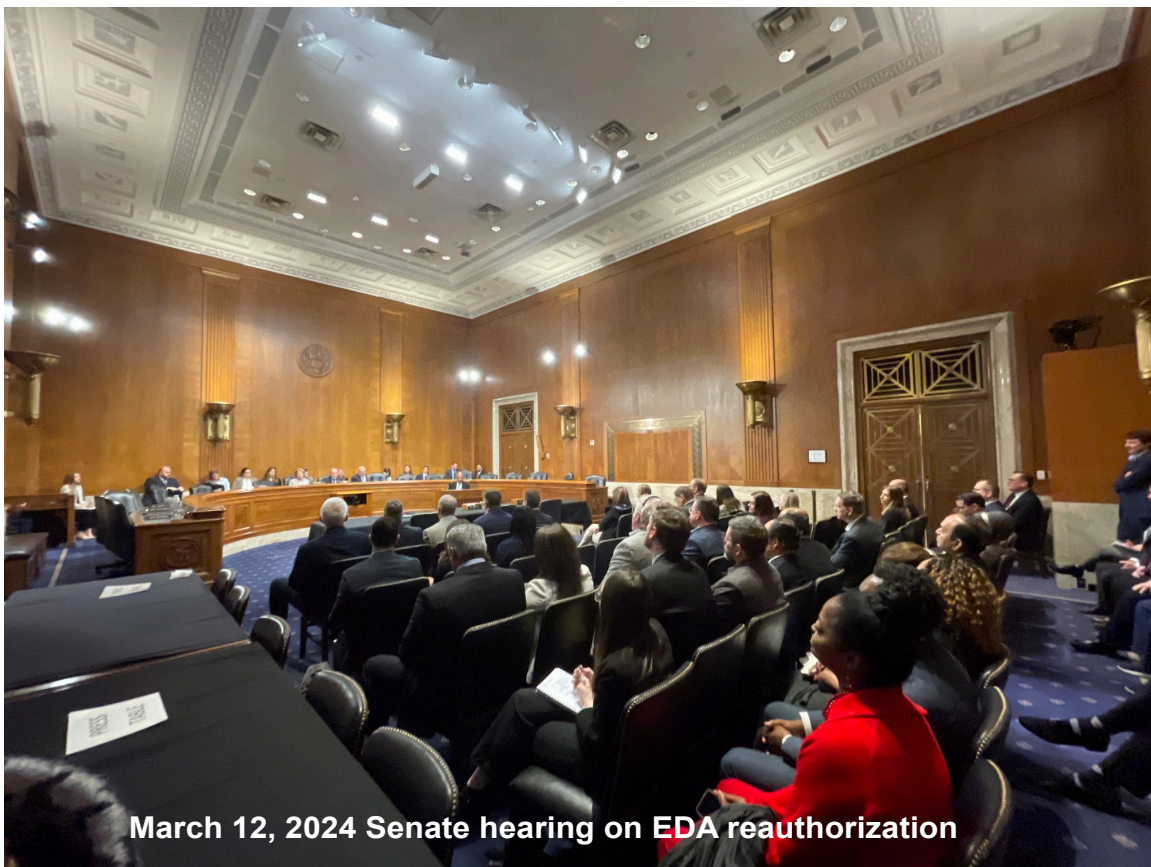
March 12, 2024 Senate hearing on EDA reauthorization