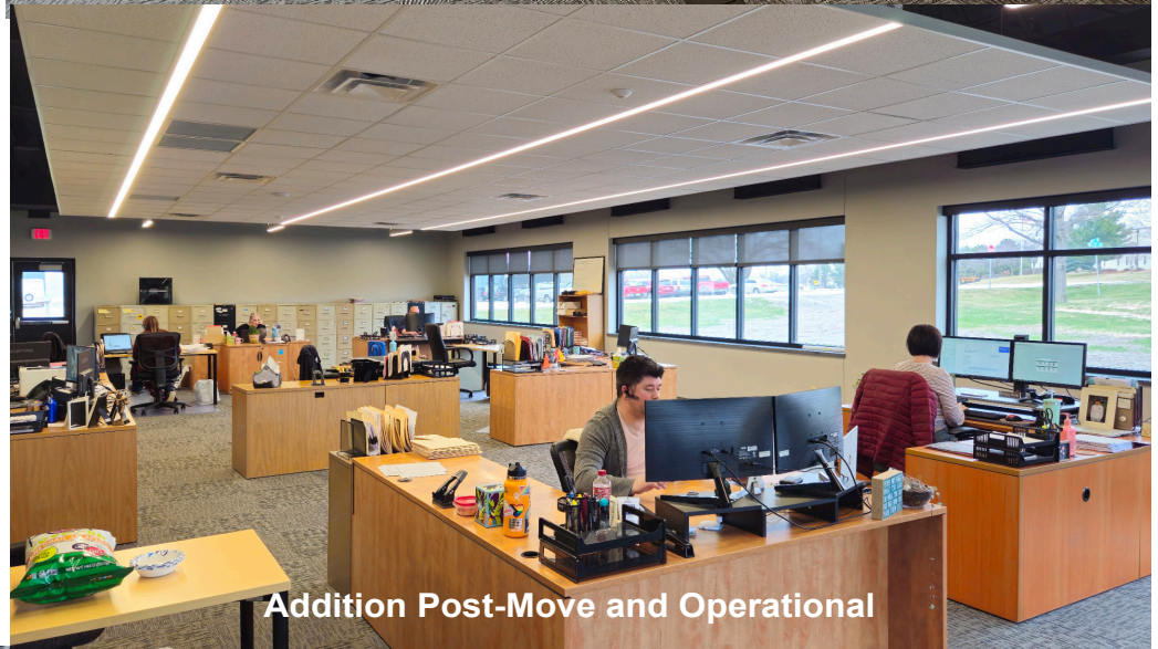
Addition Post-Move and Operational