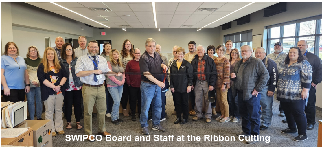
SWIPCO Board and Staff at the Ribbon Cutting

Atlantic, IA – Southwest Iowa Planning Council (SWIPCO) is celebrating the completion of an addition to their main office in Atlantic. SWIPCO and Southwest Iowa Transit Agency continue to grow, providing more services and working on more projects than ever that benefit the residents of Southwest Iowa.