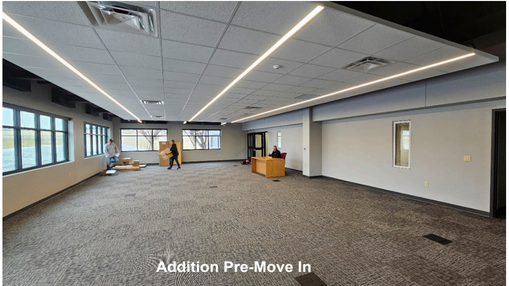
Addition Pre-Move In

SWIPCO celebrated the new space with Policy Council Members after their meeting on March 28th.