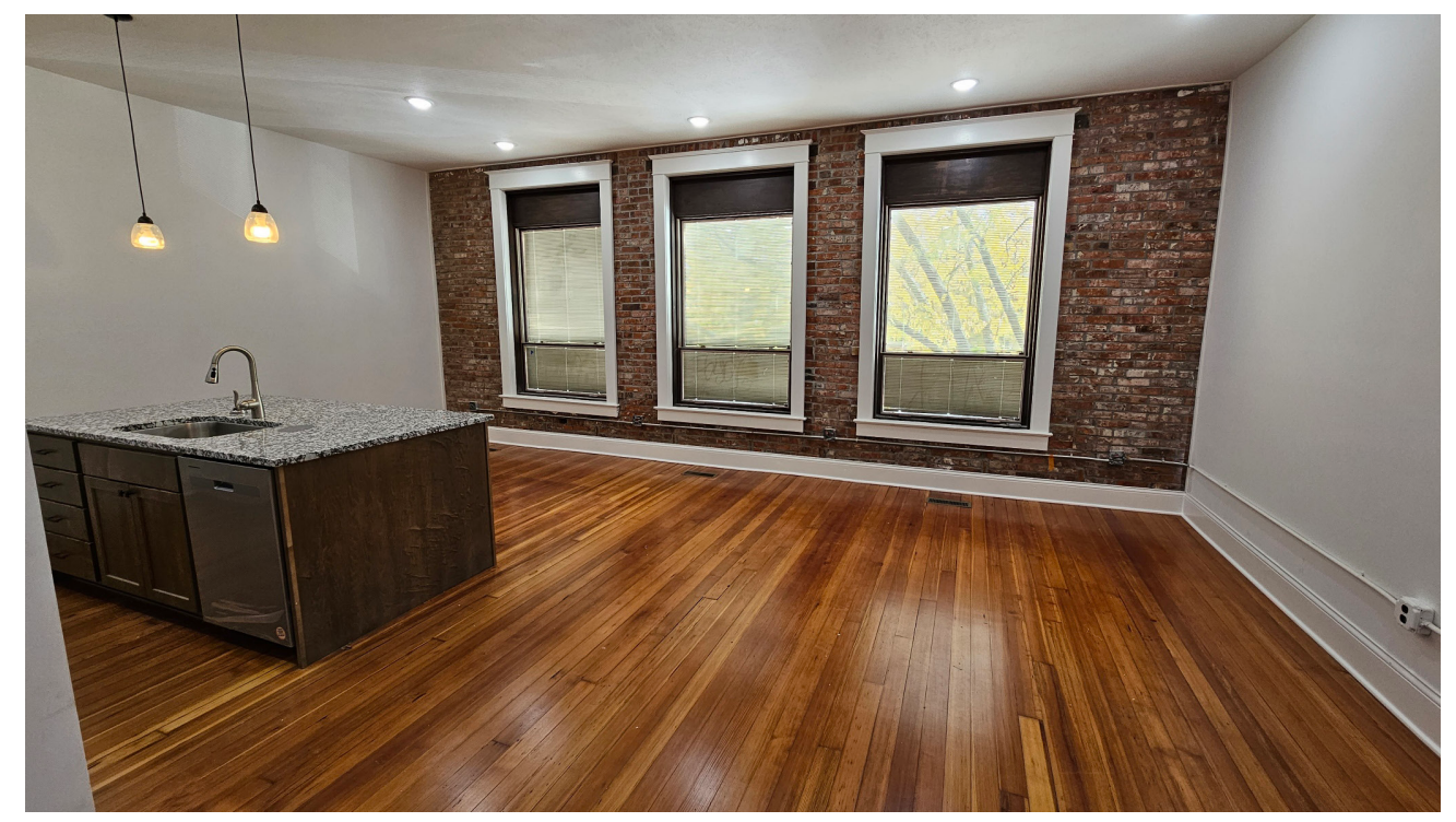
Upper story housing at 509 Chestnut Street in Atlantic

For more information on the Downtown Revitalization or Upper Story Housing Conversion CDBG grants, please contact SWIPCO at 712-243-4196.