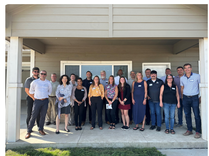
Touring in Woodbine

The initial funding was available for communities and counties to apply for to support building new homes, rehabbing homes, and rebuilding vital infrastructure. The cities of Woodbine and Glenwood applied and then took bids for projects from developers.