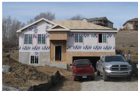
1104A Linn in Glenwood

Shenandoah is revitalizing West Lowell Street by acquiring and