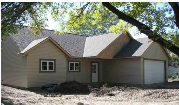
1112 West Lowell, Shenandoah