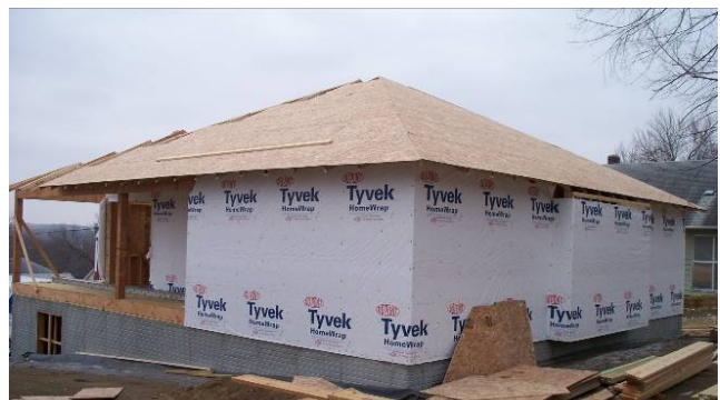
1710 Bluff, Hamburg