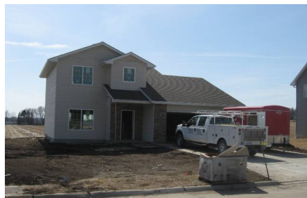
Lot 1, Nishna Ridge Subdivision, Avoca

demolishing several vacant dilapidated housing units. These homes are then replaced with newly constructed homes.