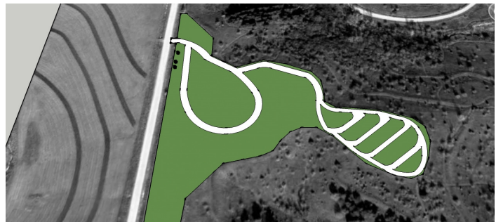
Below: computer model of Pierce Creek Park